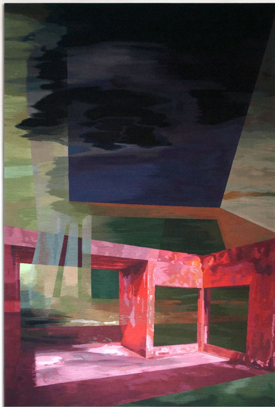
Casino Bokor 318 x 212cm