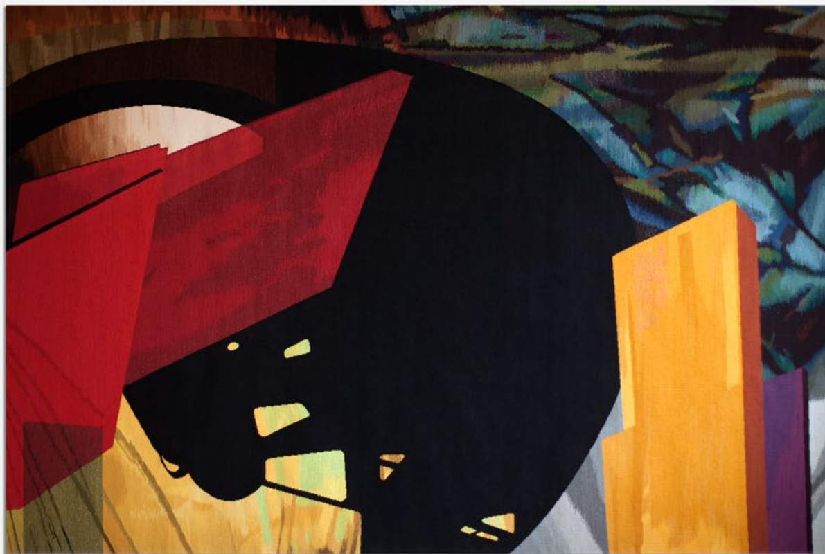
Matter 214 320 cm