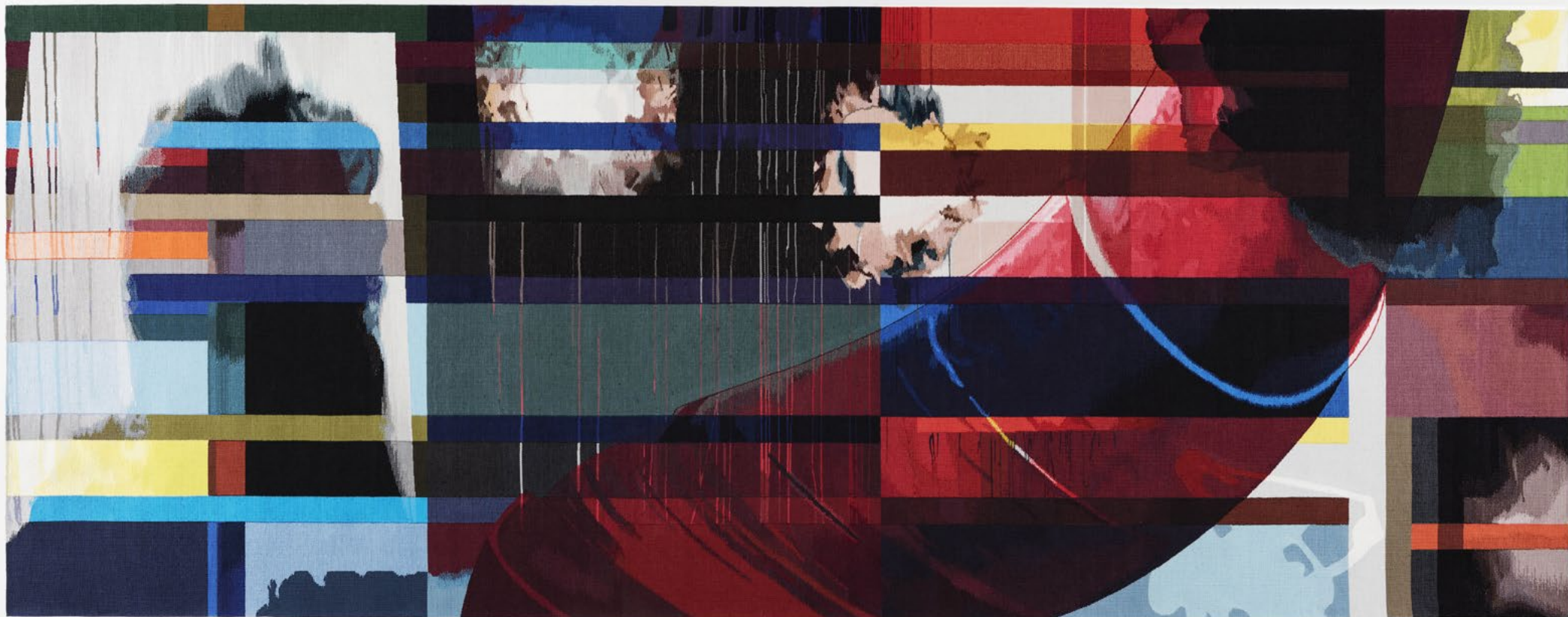
Sometimes it Snows in April 214 x 548cm