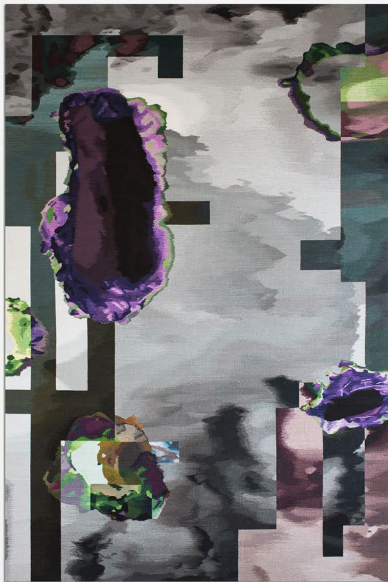
Turbo Violet 318 x 213cm