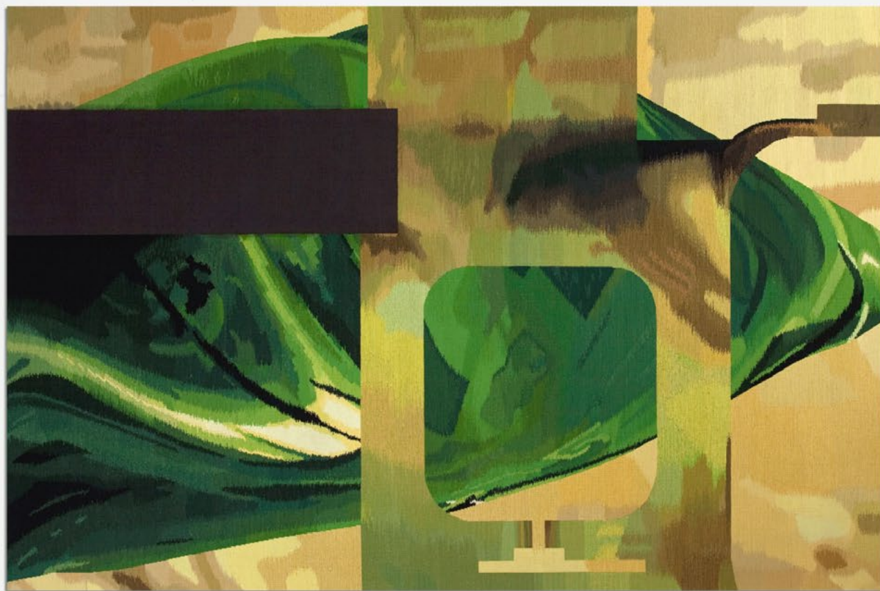
Post Caput Mortem 212 x 322cm