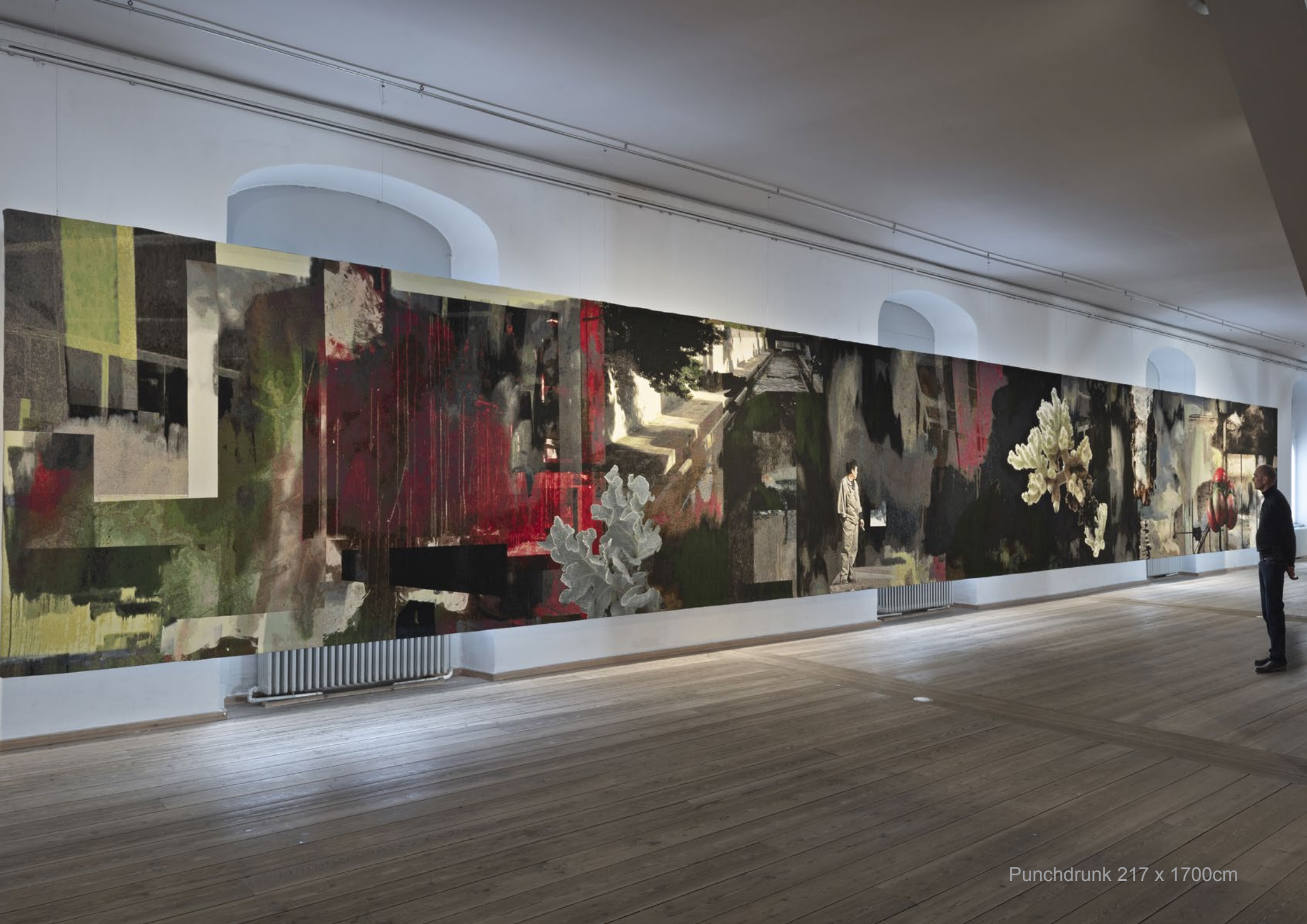
Punchdrunk 217 x 1700cm