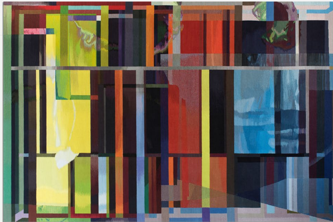
Reflex 212 x 322cm