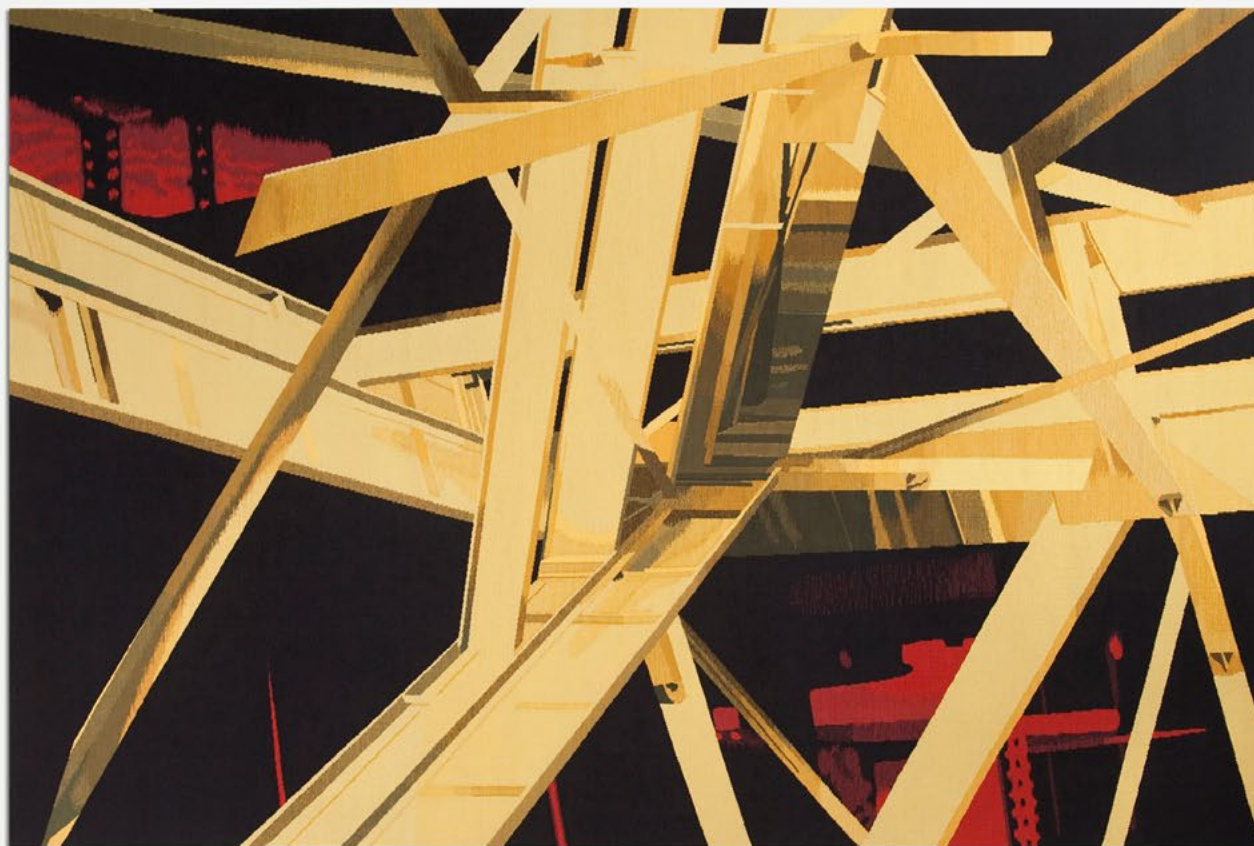
Bewildered Yellow 212 x 322 cm