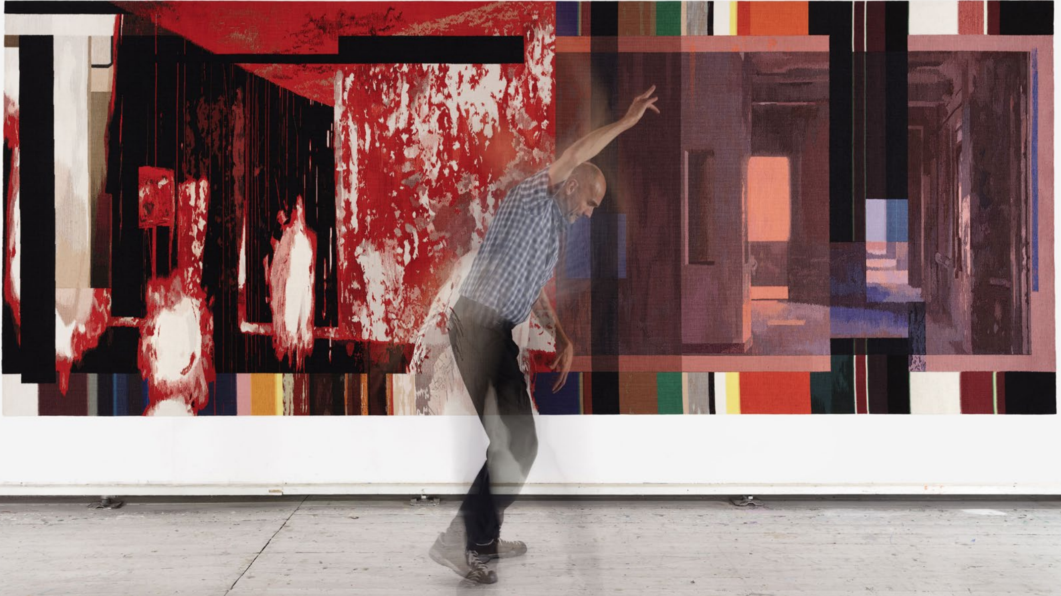
Bright Red 214 x 547cm